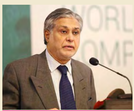
Federal Minister Ishaq Dar speaks at the Seminar as Chief Guest

CP held a Seminar to mark the World Competition Day on 5th December, 2014 at Marriott Hotel Islamabad. Every year on 5th December, Competition agencies around the world organize seminars and other events to increase consumer awareness regarding competition issues and the role competition agencies can play for making markets competitive resulting in consumer welfare. It was on the 5th of December, 1980 that the UN General Assembly, at its thirty-fifth session in its resolution 35/63 adopted the Set of Multilaterally Agreed Equitable Principles and Rules for the Control of Restrictive Business.