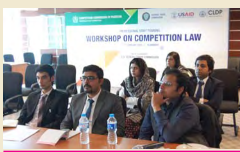
Participants of workshop